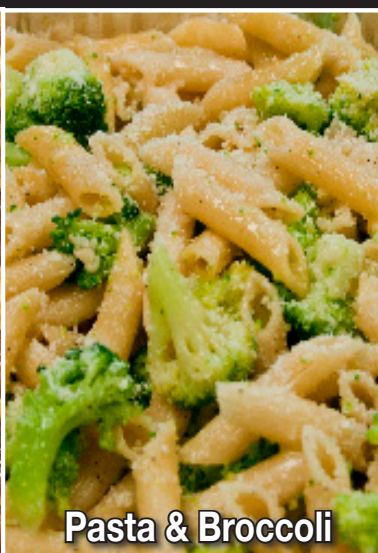
Pasta & Broccoli