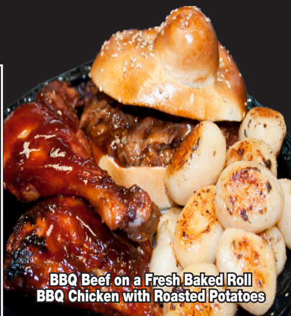
BBQ Beef on a Fresh Baked Roll BBQ Chicken with Roasted Potatoes