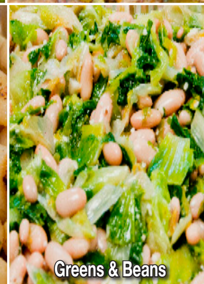
Greens & Beans

Salvatore's • Setup-N-Go Catering • Since 1978