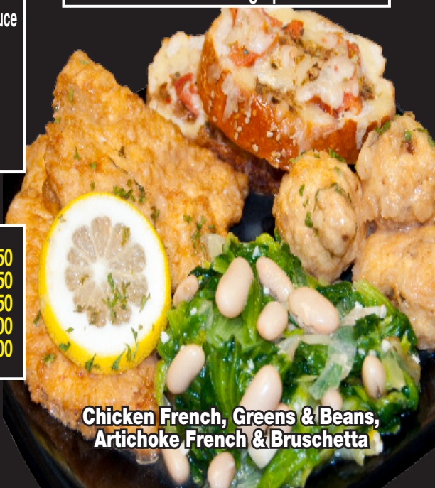
Chicken French, Greens & Beans, Artichoke French & Bruschetta

Place Setting p/p $2 • Utensils Only p/p $1 Individual Serving Spoon $2