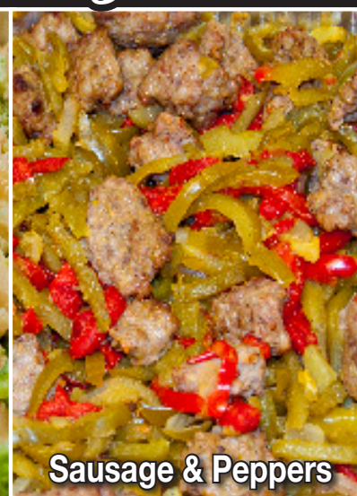
Sausage & Peppers